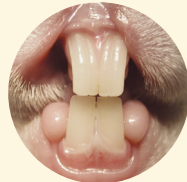
Healthy incisor teeth should normally meet – as above