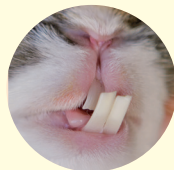
Misaligned and overgrown incisor (front) teeth

Vaccination: Rabbits can be vaccinated against Myxomatosis and Viral Haemorrhagic Disease. Both of these can be rapidly fatal. There are vaccines available that give good protection and are recommended for yearly use. Since myxomatosis can be spread by flies and mosquitoes, it is recommended to have indoor rabbits vaccinated as well. If you would like further information on caring for your rabbit, feeding, dental health and vaccination, please don't hesitate to contact our helpful team.